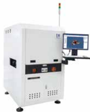
3D AOI TR7700Q